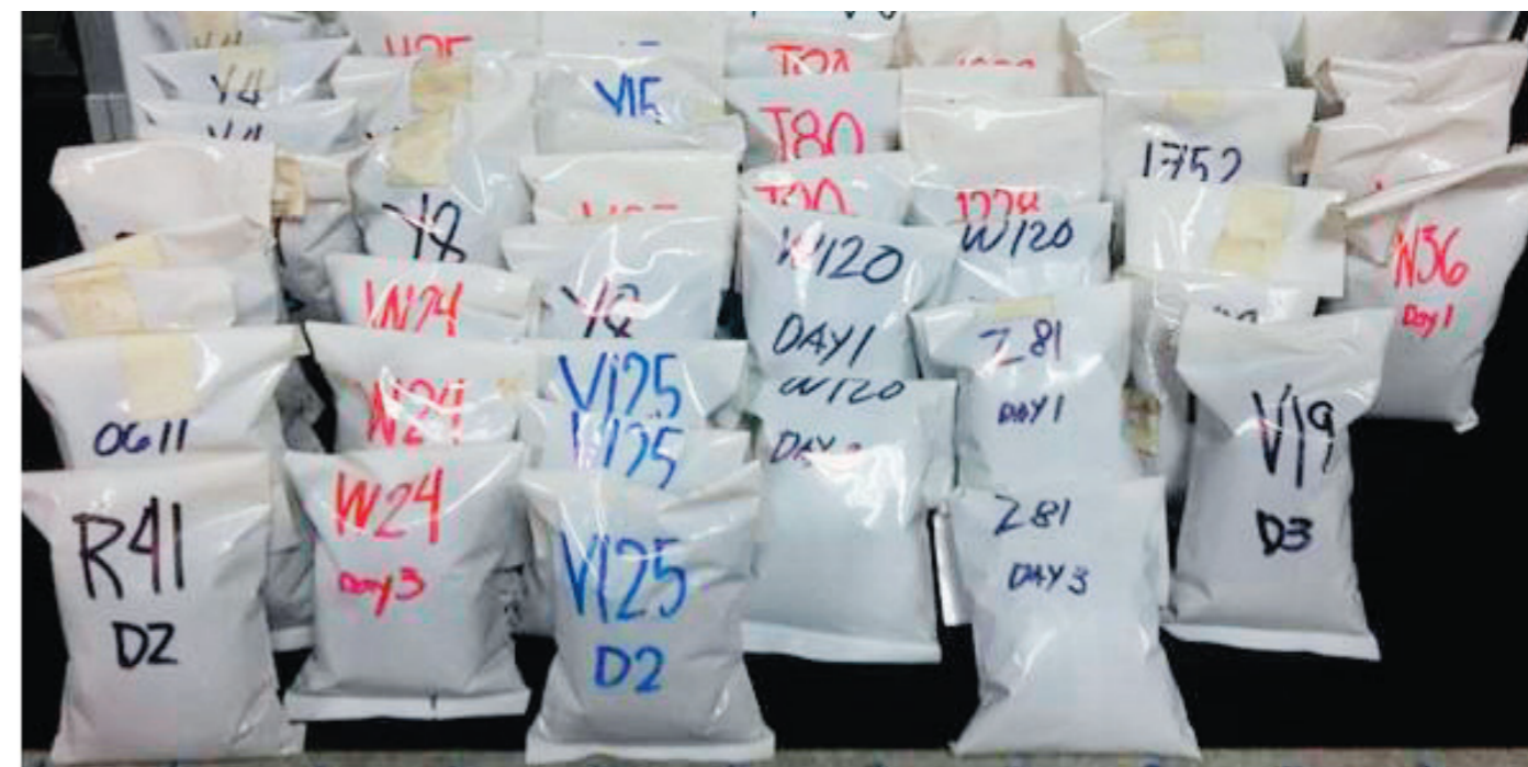
Corn distillers dried grains with soluble (DDGS) are packed for the specific treatments.

D airy carabaos’ milk can be increased by feeding them with corn distillers dried grains added with solubles (DDGS), a study by PCC showed.