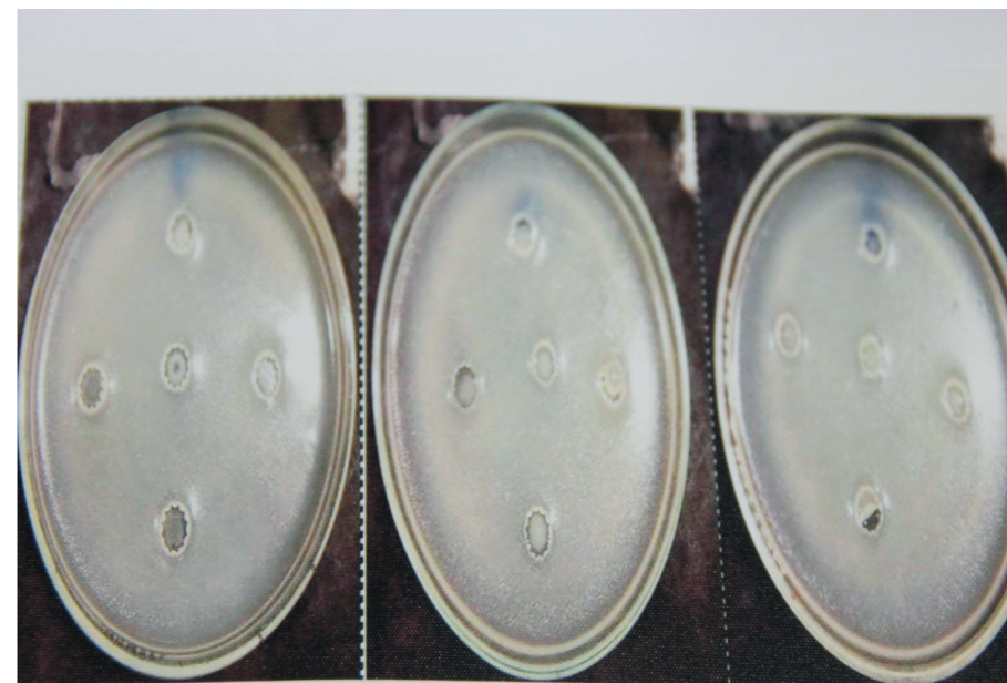
Antibiotic sensitivity test result of Acinetobacter schindleri .

A ntibiotic resistance, caused by the repeated use of it, may lead to difficulty of treatment in certain livestock diseases. This poses economic losses in the industry.