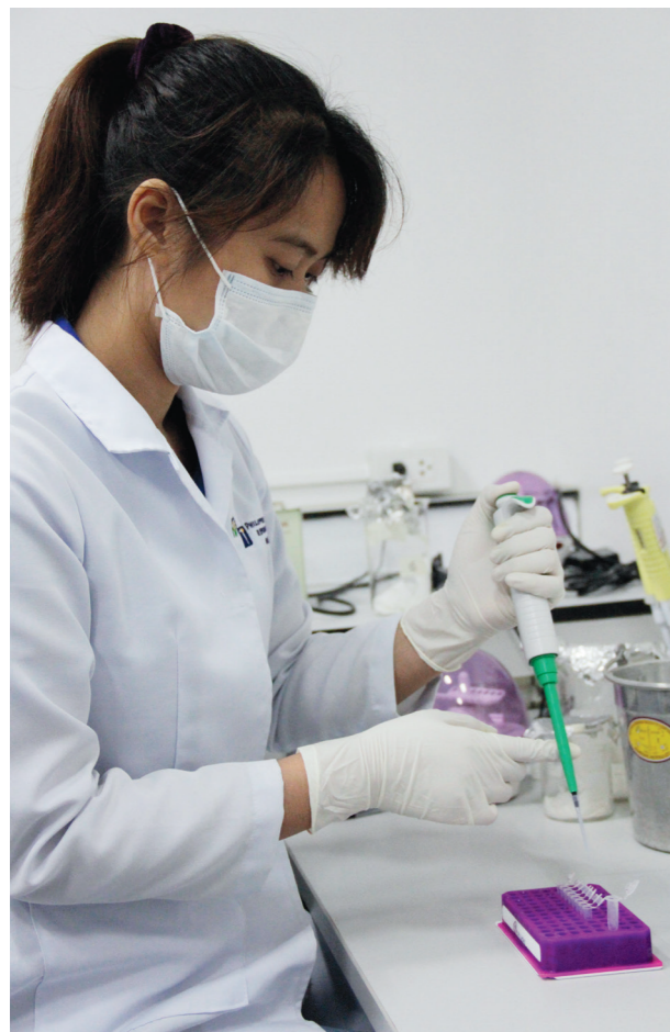
The researcher prepares reagent to be used in amplifying the PLCZeta gene of Swamp and Riverine types of water buffalo.